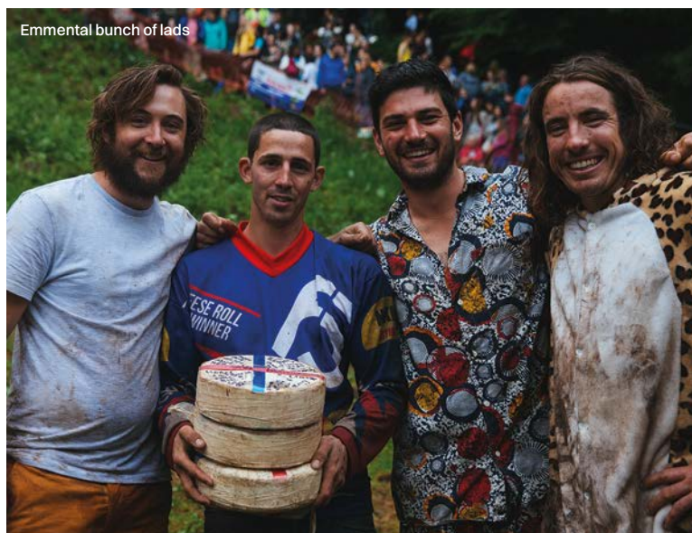
Emmental bunch of lads