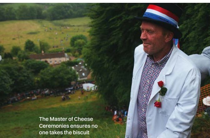
The Master of Cheese Ceremonies ensures no one takes the biscuit

There's a faint ridge running down the middle of the hill. I always try to stick to either side of it. It's actually slower staying on your feet on the steepest parts.