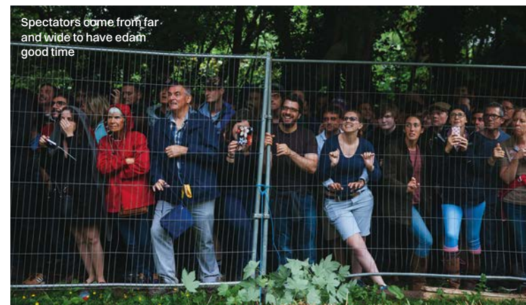
Spectators come from far and wide to have edam good time