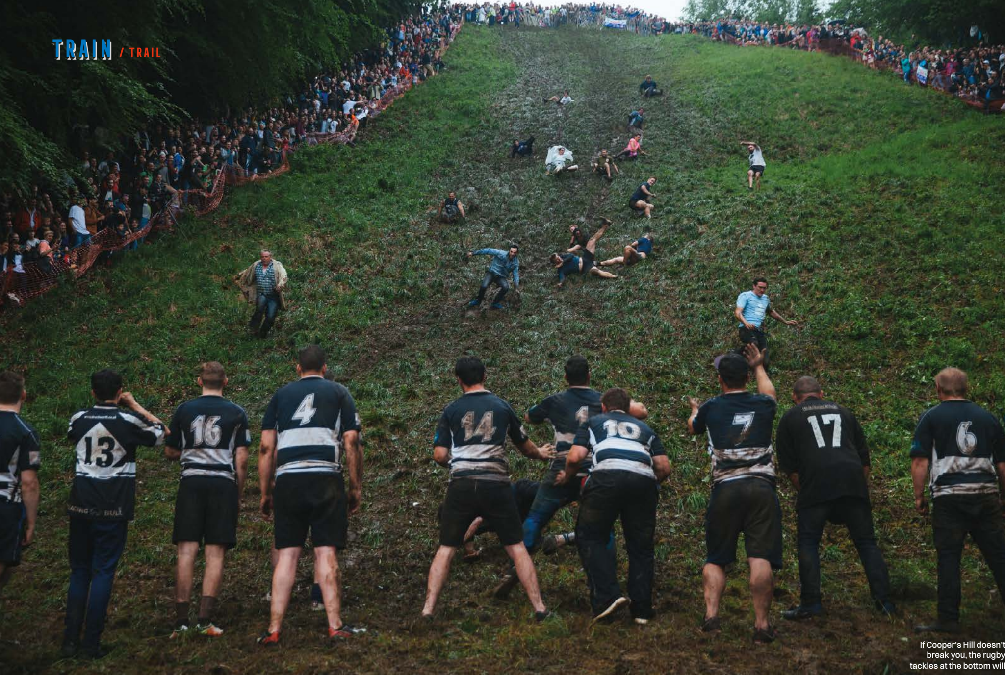
If Cooper's Hill doesn't break you, the rugby tackles at the bottom will